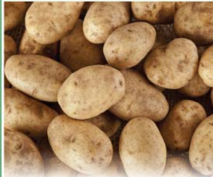
Potatoes 10 lb. bag