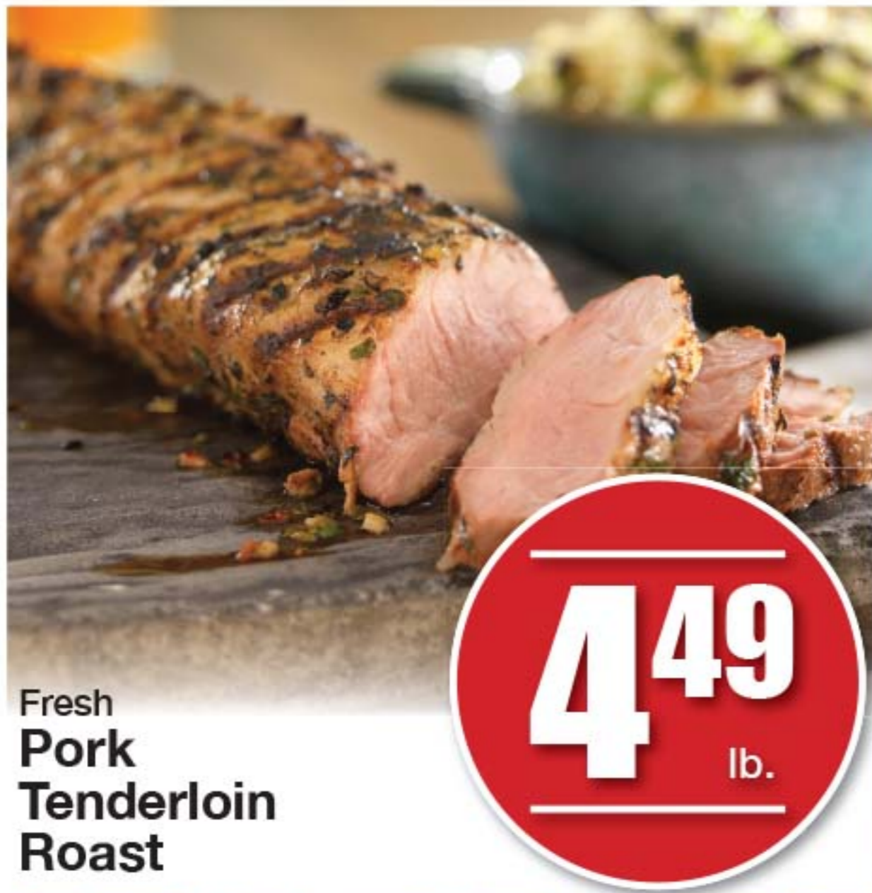
Fresh Pork Tenderloin Roast