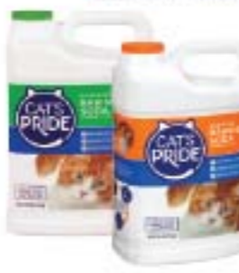
Cat's Pride Litter with Baking Soda 10 lb.