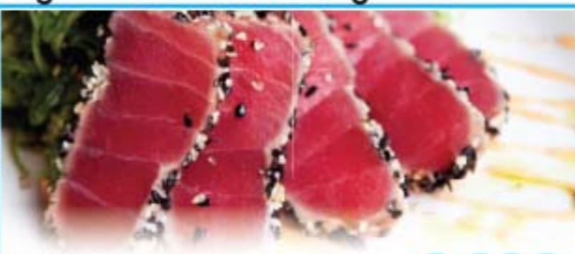
Wild Caught Ahi Tuna Steaks