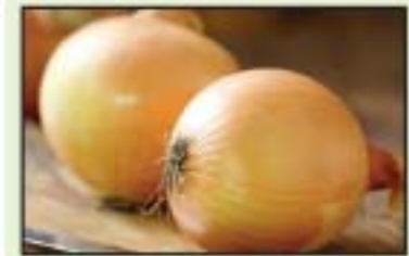
Brown or Yellow Onions