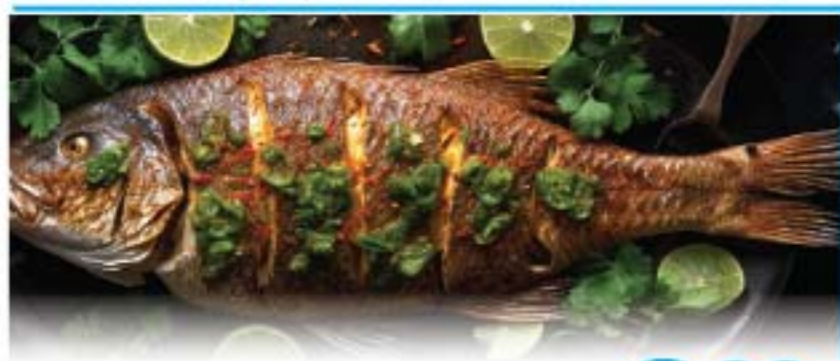
Clean Ready to Cook Whole Tilapia