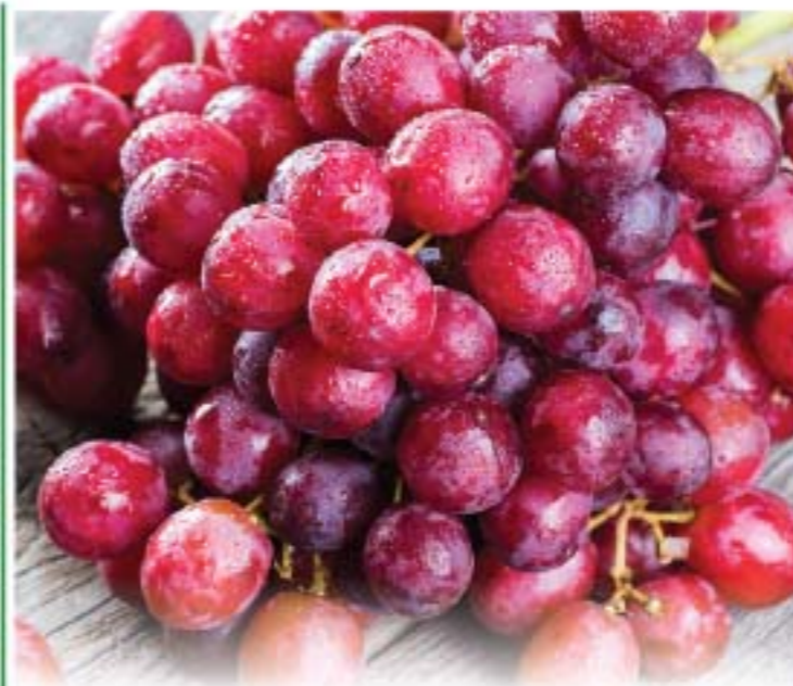
Seedless Red Grapes