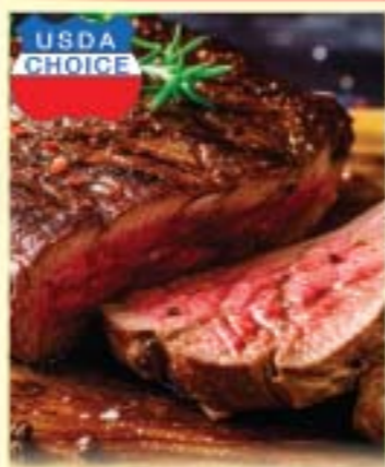
USDA Choice Cross Rib Roast Carne para Cocer