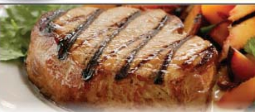
Previously Frozen Bone-In Pork Sirloin Chops