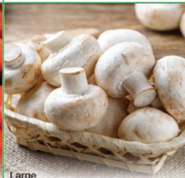
Large Monterey White Mushrooms