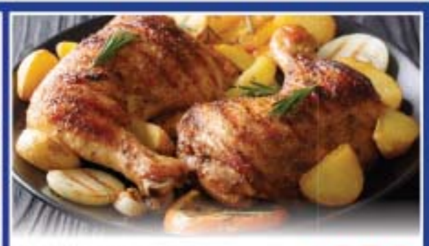
Fresh, Never Frozen Chicken Leg Quarter