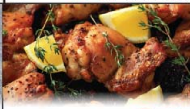
Fresh, Never Frozen Chicken Thighs