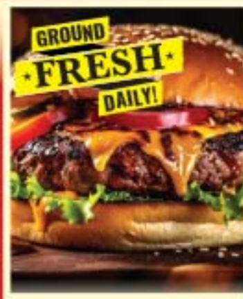
85% Lean Ground Beef