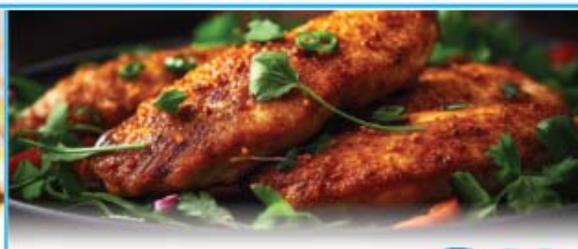
Clean Ready to Cook Basa or Swai Fillet