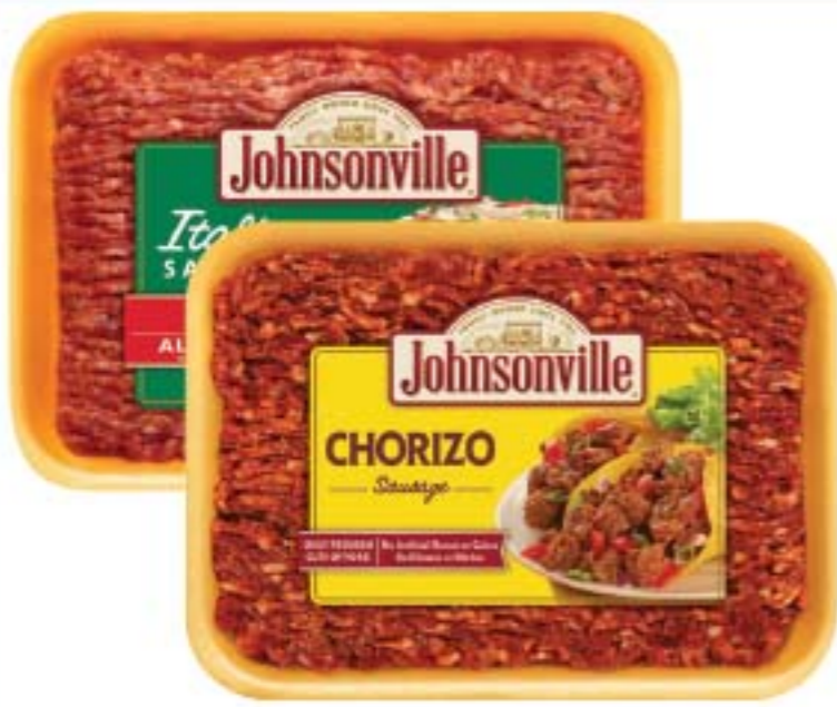
Johnsonville Ground Sausage or Chorizo 16 oz.