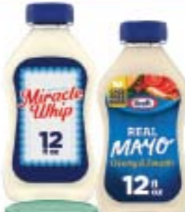
Kraft Squeeze Mayo or Miracle Whip 12 oz.