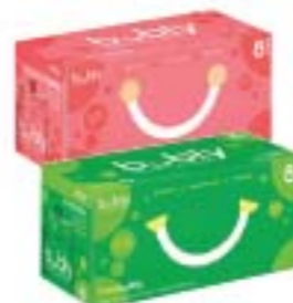
Bubly 8 pack