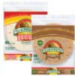
Guerrero Flour Riquisimas Tortillas 10 count or Whole Wheat Tortillas 11 count