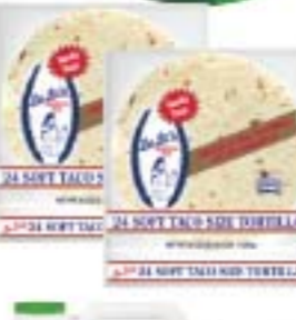
La La's Soft Taco Tortillas 24 count