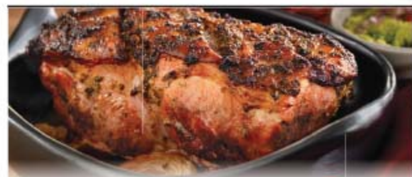
Fresh Whole Pork Butt Roast