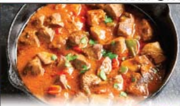
Fresh, Never Frozen Boneless Skinless Chicken Leg Meat