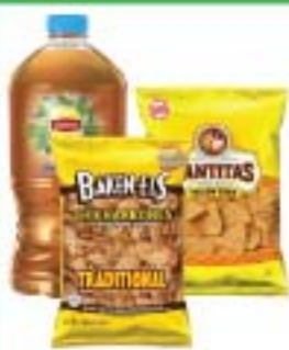
Lipton Tea, 64 oz., Santitas Tortilla Chips 10.6-16 oz. or Baken-ets, Chester's, Sabritas 3.25-6 oz.