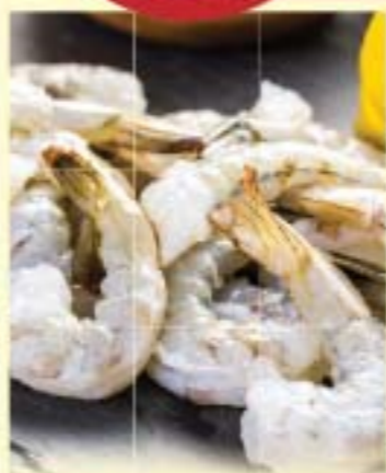
31-40 count Medium Raw Shrimp