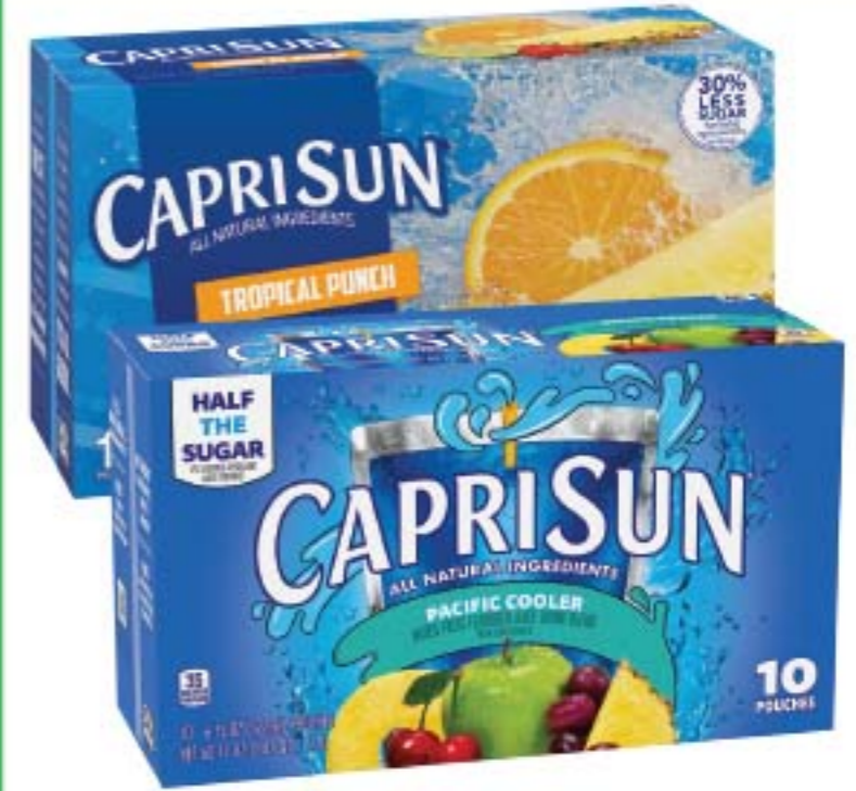
Capri Sun 10 pack