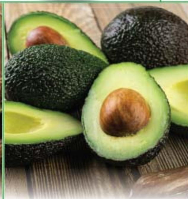
Small Hass Avocados