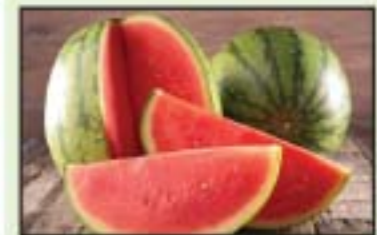
Mini Seedless Melons