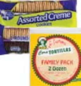
Lil' Dutch Maid Crème Cookies 25 oz. or La Suprema Corn Tortillas 24 count