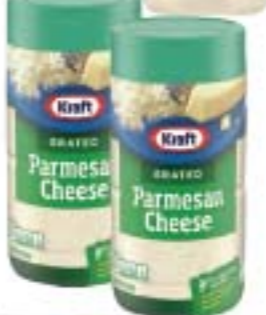
Kraft Grated Parmesan Cheese 8 oz.