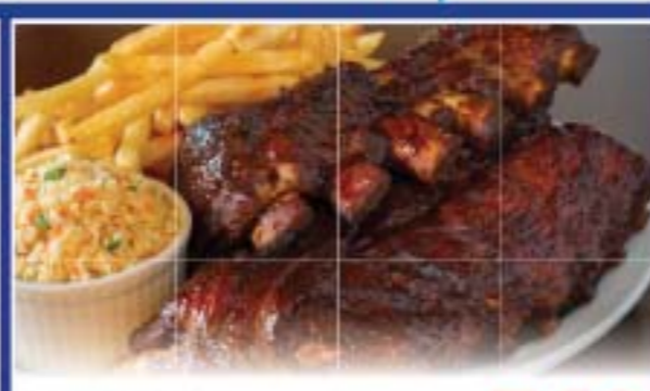
Fresh Meaty Baby Back Pork Ribs