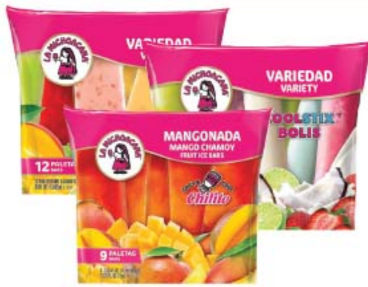
La Michoacana Ice Cream Bars, Pops or Mango Heladas 9-12 pack