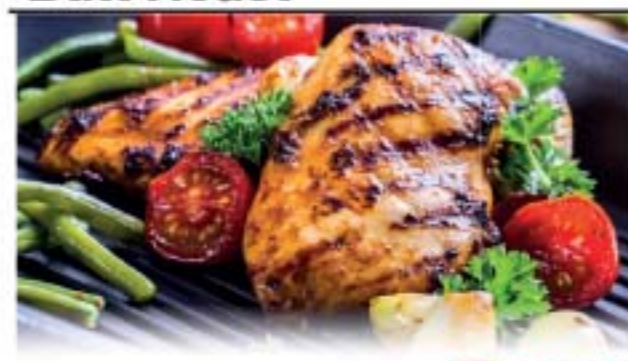
Fresh, Never Frozen Boneless Skinless Chicken Breast