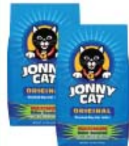
Jonny Cat Original Cat Litter 10 lb.