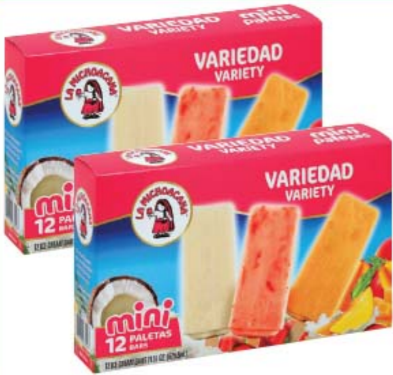
La Michoacana Mini Ice Cream Bars 12 count