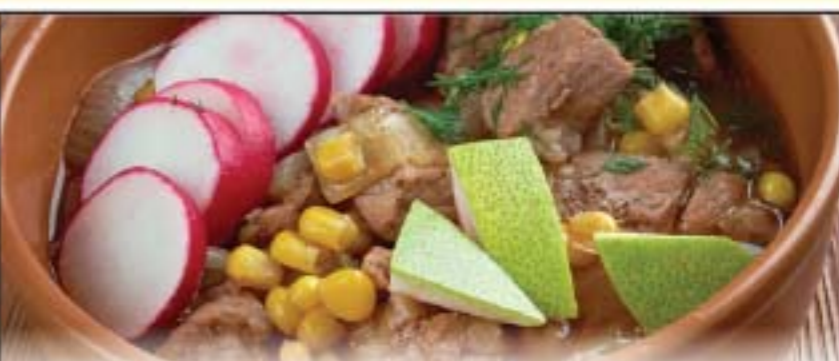
Previously Frozen Bone-In Pork Cubes or Pozole Meat