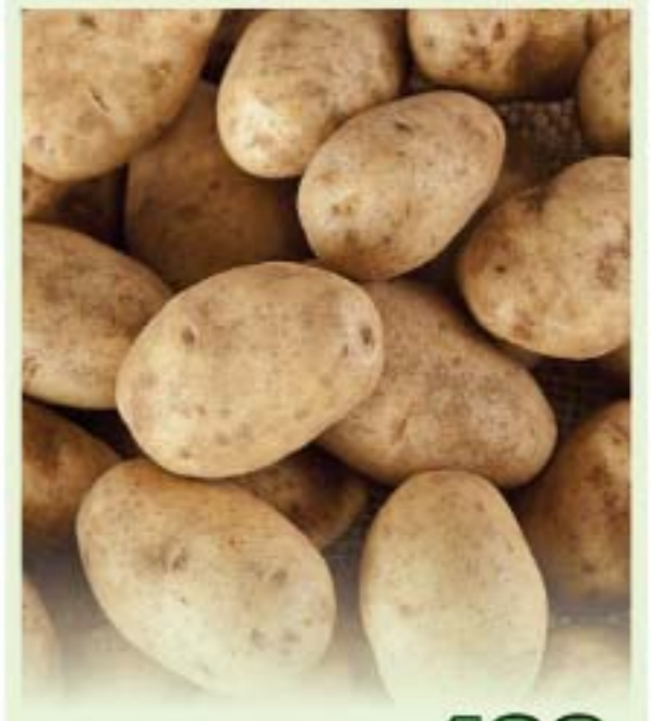
Potatoes 10 lb. bag