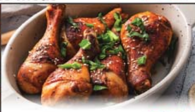
Fresh, Never Frozen Chicken Drumsticks