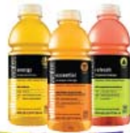
Vitamin Water 20 oz.