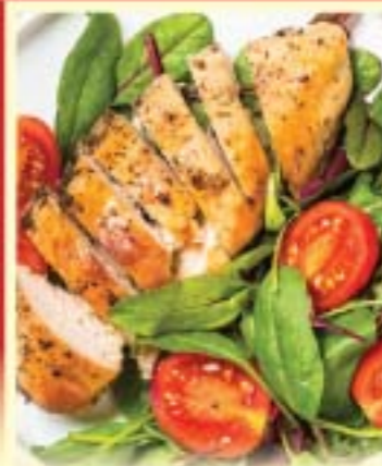
Fresh Never Frozen Boneless Skinless Chicken Breast