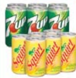
Squirt or 7-Up 6 pack, 7.5 oz. mini cans