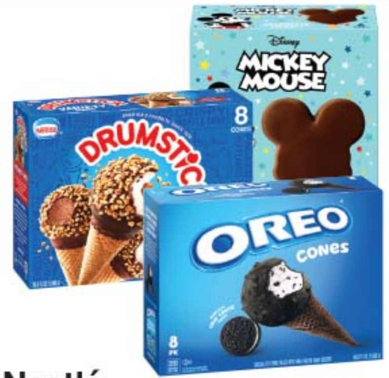
Nestlé Ice Cream Novelties 8 pack