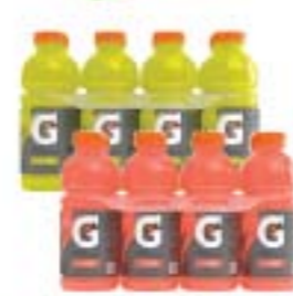
Gatorade 8 pack