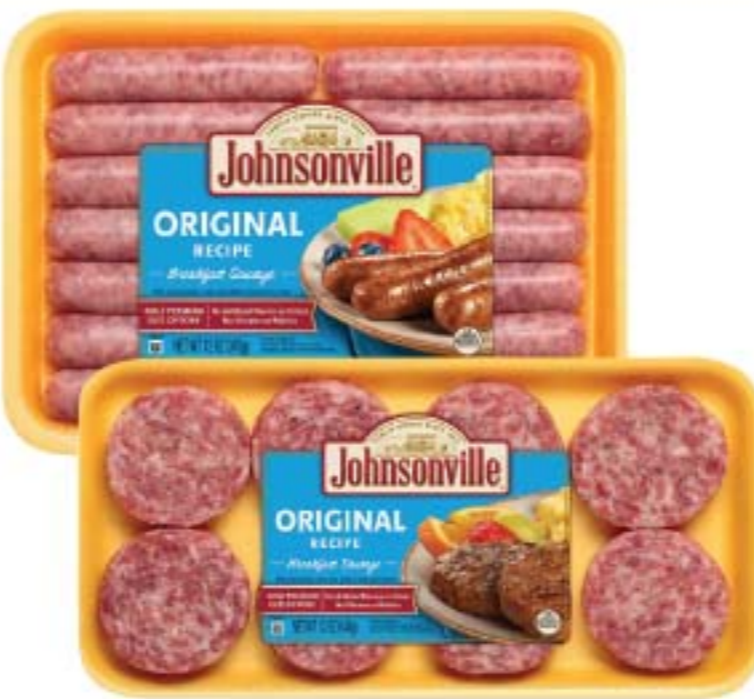
Johnsonville Breakfast Links or Patties 9.6-12 oz.