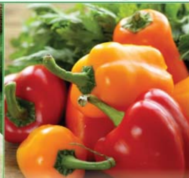
Red, Gold, Green or Orange Bell Peppers 5 for 5