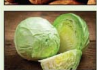
Green Cabbage 59¢ lb.