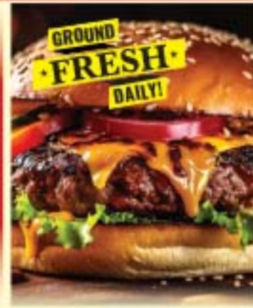
90% Extra Lean Ground Beef