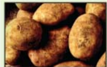
Premium Russet Potatoes 49¢ lb.