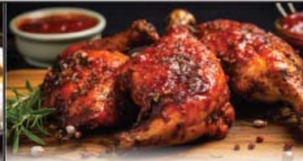
Fresh Never Frozen Chicken Leg Quarters