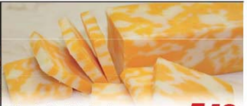
Value Pack, All Natural Monterey Jack or Colby Long Horn Cheese