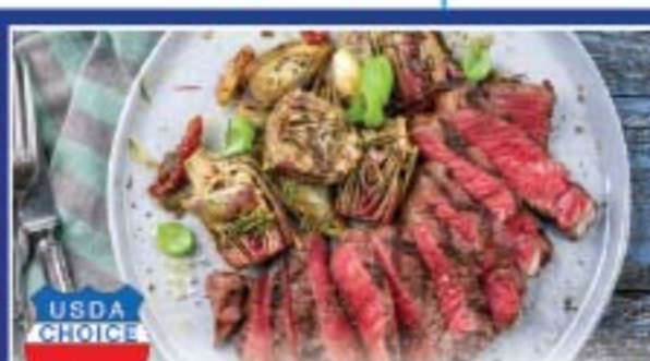
USDA Choice Boneless Center Cut Chuck Steaks