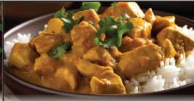
Fresh, Never Frozen Boneless Skinless Chicken Leg Meat