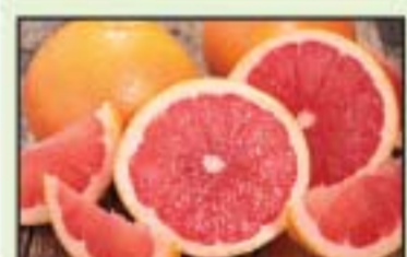
Pink Grapefruit 1 25 ea.