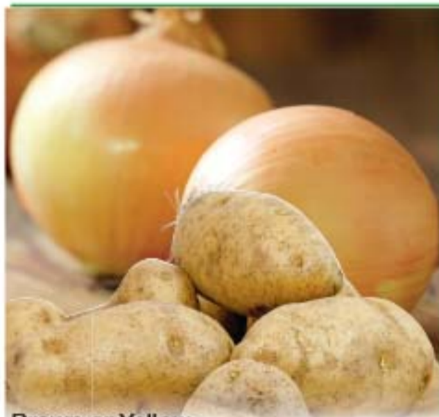
Brown or Yellow Onions or Premium Russet Potatoes 59¢ lb.