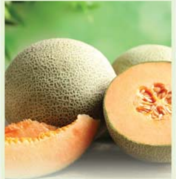
Large Cantaloupe 49¢ lb.

Wednesday & Thursday November 13th - 14th