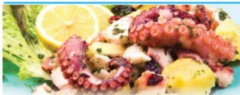
Cooked Cut Pieces Octopus