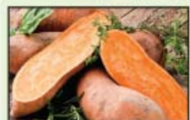
Sweet Yams 99¢ lb.