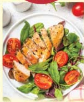
Fresh Never Frozen Boneless Skinless Chicken Breast