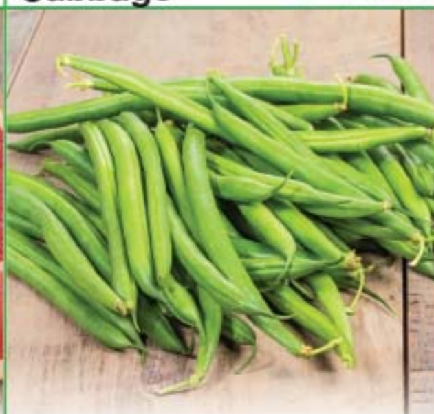
Green Beans 1 99 lb.