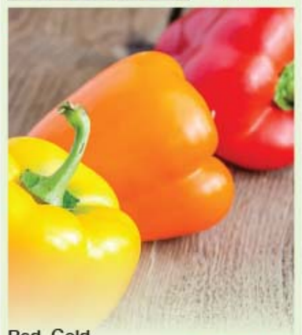
Red, Gold, Green or Orange Bell Peppers 77¢ ea.