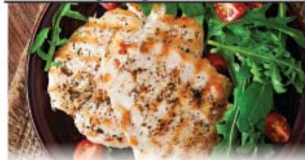
Fresh, Never Frozen Boneless Skinless Chicken Breast