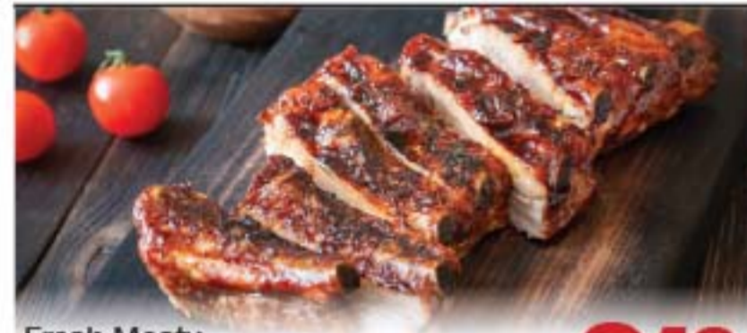
Fresh Meaty Pork Shoulder Country Style Ribs