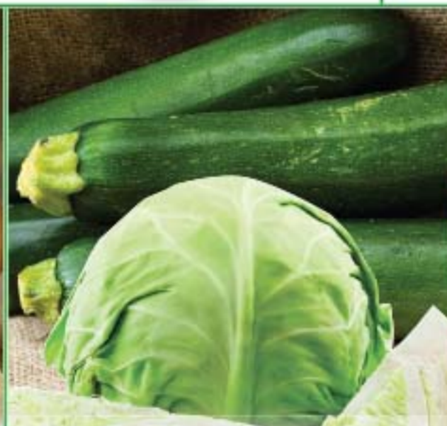
Italian Squash or Green Cabbage 79¢ lb.