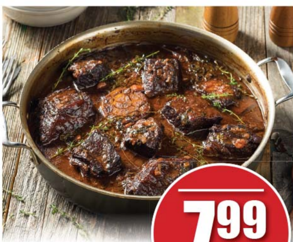
Meaty Beef Flanken Style Ribs or Short Ribs