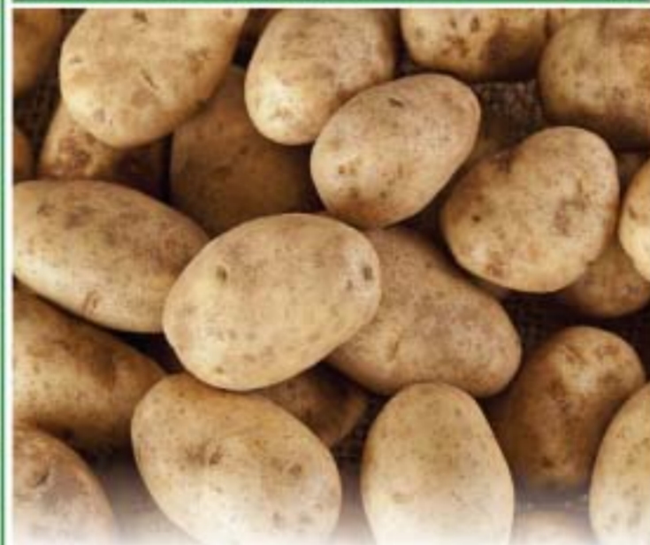
Potatoes 10 lb. bag 3 99 ea.