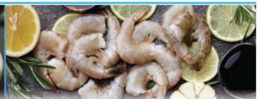
16-20 count Jumbo Raw Shrimp