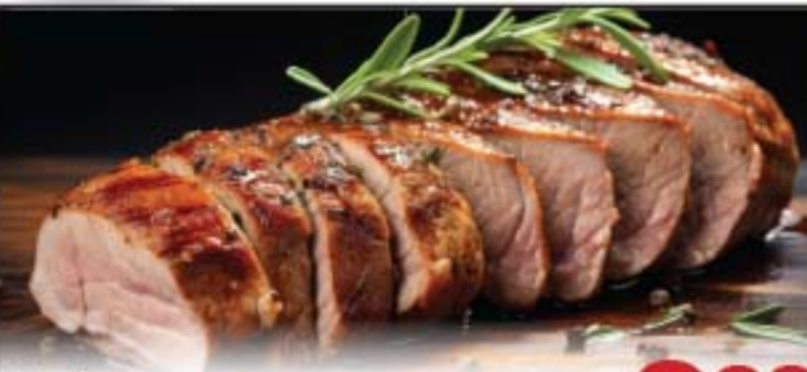
Fresh Boneless Pork Loin Roast