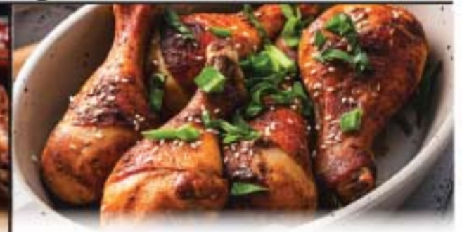
Fresh Never Frozen Chicken Drumsticks