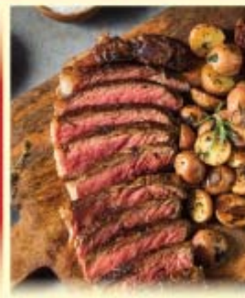
Fresh New York Strip Steaks