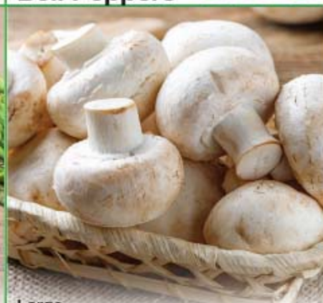
Large Monterey Whole Mushrooms 2 99 lb.