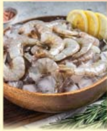
31-40 count Large Raw Shrimp