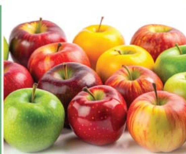
Large Gala, Fuji, Granny Smith or Premium Red Delicious Apples 99¢ lb.