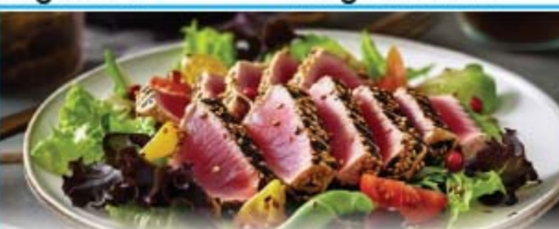
Wild Caught Ahi Tuna Steaks