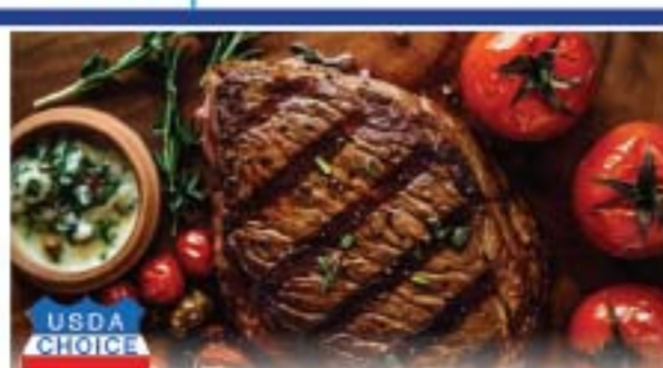
USDA Choice Beef Ranch Steaks Carne para Asar de Res

3 day sale Friday-Sunday November 15th - 17th