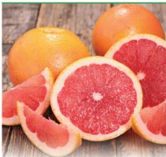
Pink Grapefruit 2 for 3